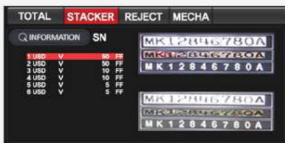
Display in the machine

Accurate Recognition of Serial number Full Color Image and accurate recognition of OCR for serial number