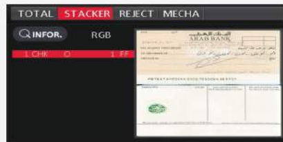
Display in the machine

MICR Recognition of Cheque and Voucher Full Color Image and OCR of MICR