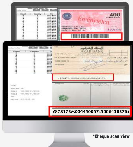
*Cheque scan view